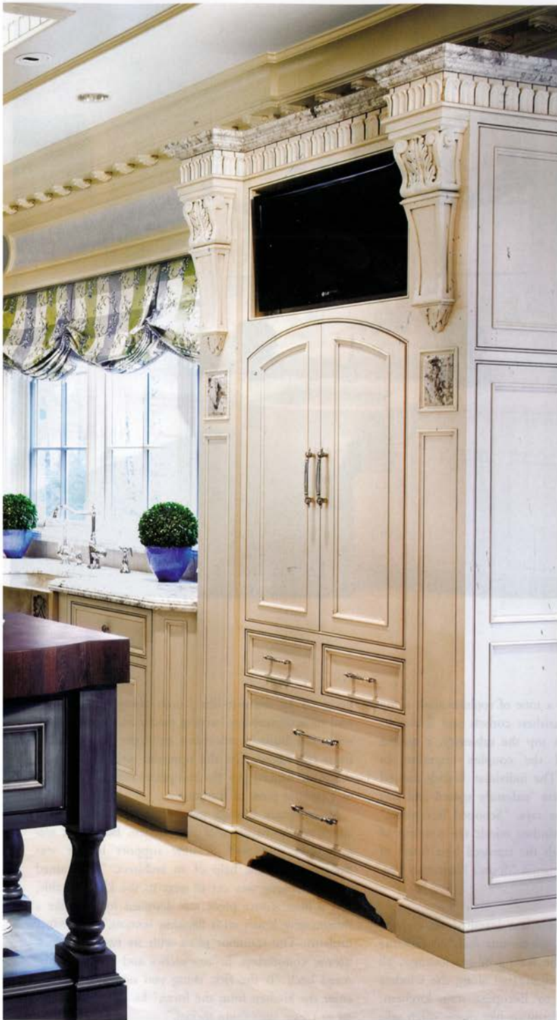
INTERIOR DESIGNER JANE W. PIERSON

Multiple layers of molding and a barrel-vaulted ceiling enhanced by silverleaf and LED cove lighting add prominence to glazed cream cabinetry. Delicatus granite — mitered and stacked 2½-inches thick — tops the cabinetry and coordinates with the countertops. The island is stained and glazed denim blue, and both ends are covered in 5-inch wenge butcher block. The armoire-like hutch houses serving pieces on top, silverware in the middle drawers and plates in the bottom, which is fitted with pegs to allow stacking. A custom limestone hood and mosaic backsplash provide a regal focal point above the range. The designer kept the grout lines tight on the Italian porcelain tile floor so the 16-by-32-inch brick pattern appears as a restrained backdrop.