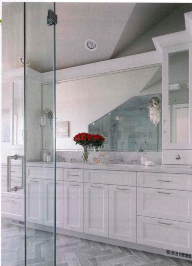
ALL THAT SHINES Passanante chose stainless fixtures and hardware to add a touch of sparkle to the room. The custom mirror reflects the entire space, making the room appear larger than it is.

Finally, the couple turned their attention to the