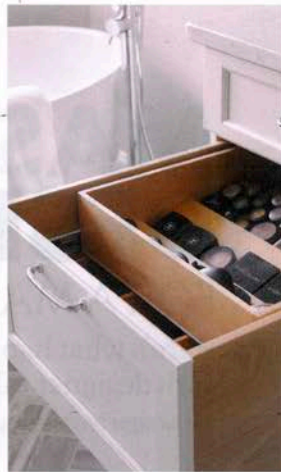
FINISHING TOUCHES The shower is honed Carrara marble with an accent wall and floor of natural pebbles. Carmelina and Anthony take a break by the lake. Custom drawers are outfitted for specific toiletries including Carmelina's make-up collection.

stuff. A tall standing cabinet serves as a linen closet. Drawers and pull-out shelves are outfitted to hold toiletries and Carmelina's makeup and accessories. "I love that makeup drawer," says Carmelina. "I can see everything I have at once." Carrara marble in a honed finish tops the vanity. An enormous custom